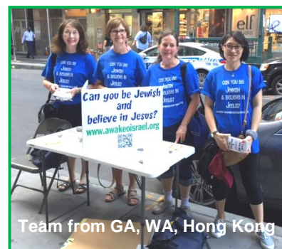
Team from GA, WA, Hong Kong