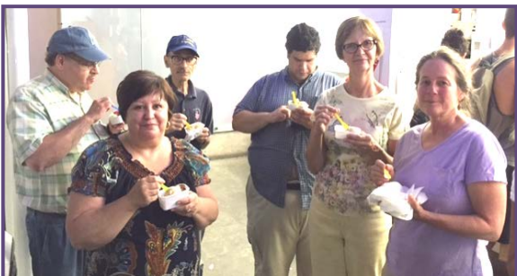
We enjoyed a little break now and then! This time, with Gelato!