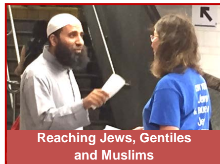
Reaching Jews, Gentiles and Muslims